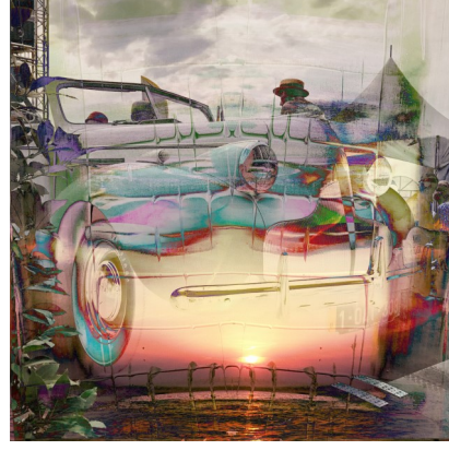
My Dream Car - Digital Mix