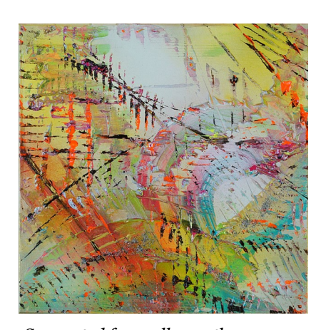
Supported from all over the World—Acryl on Canvas

With the art of Vincent Messelier, the value of your hotel will certainly raise!